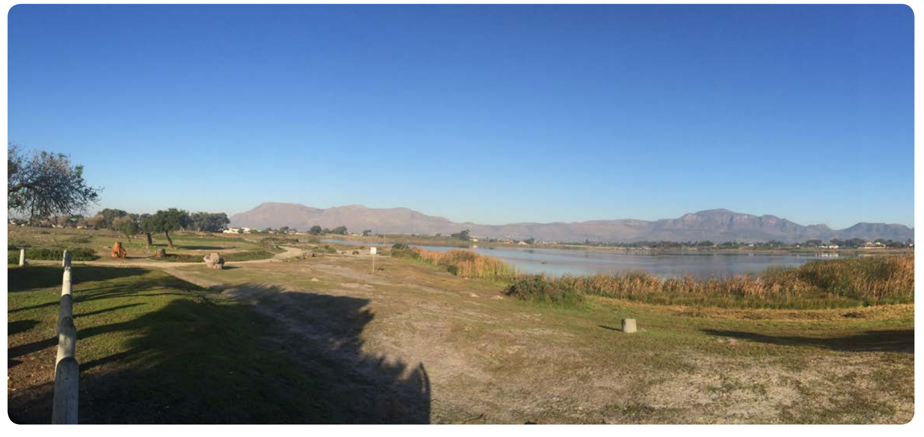
The site presents many opportunities for passive recreation, including picnicking and braaing.

Mountain views across the vlei with direct access to waters edge.